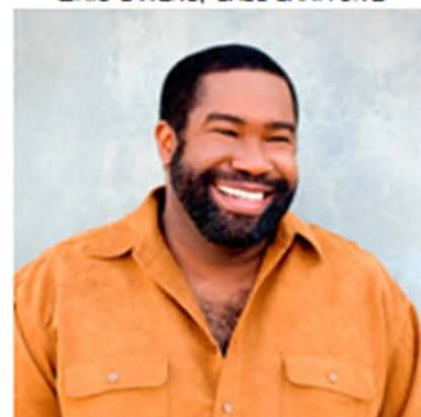
JANUARY 17, 2016 CONTACT: #6