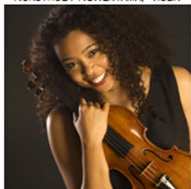
MONTH DAY DATE, YEAR CONTACT: #1