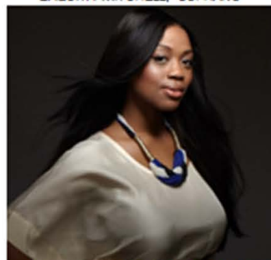
NOVEMBER 13, 14, & 15, 2015 CONTACT: #8