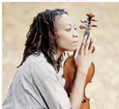
FEBRUARY 3, 2016 CONTACT: #4