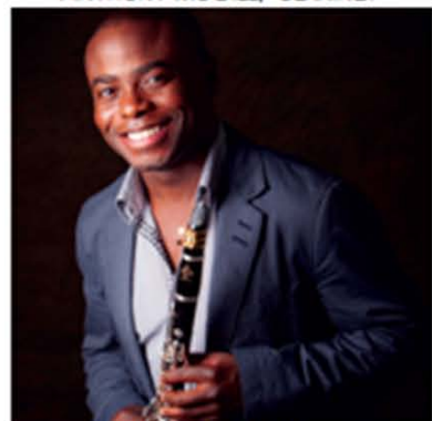
APRIL 17, 2016 CONTACT: #4