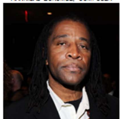
NOVEMBER 13, 14 & 15, 2015 CONTACT: #8