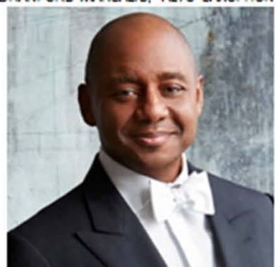
2015 - 2016 SEASON CONTACT: #5