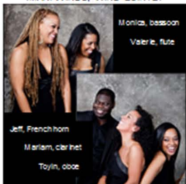
JANUARY 24 & APRIL 1, 2016 CONTACTS: #3 & #4