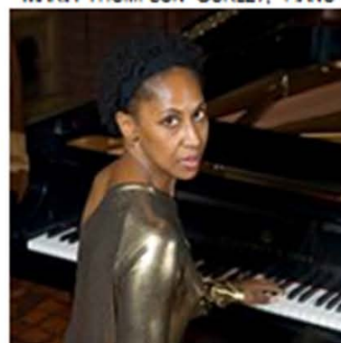
NOVEMBER 8, 2015 & FEBRUARY 27, 2016 CONTACT: #10