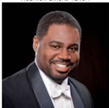
NOVEMBER 13, 14, & 15, 2015 CONTACT: #8