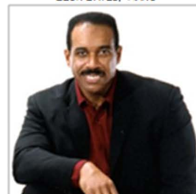
2015 - 2016 SEASON CONTACT: #9