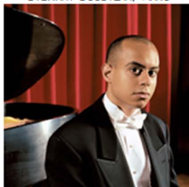
NOVEMBER 13 & 15, 2015 CONTACT: #7