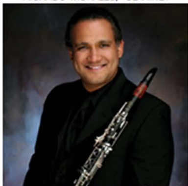
MARCH 16, 2016 CONTACT: #4