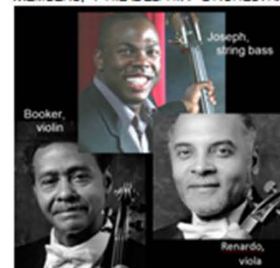
2015 - 2016 SEASON CONTACT: #8